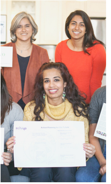
Previous U.S. Activist Retreats